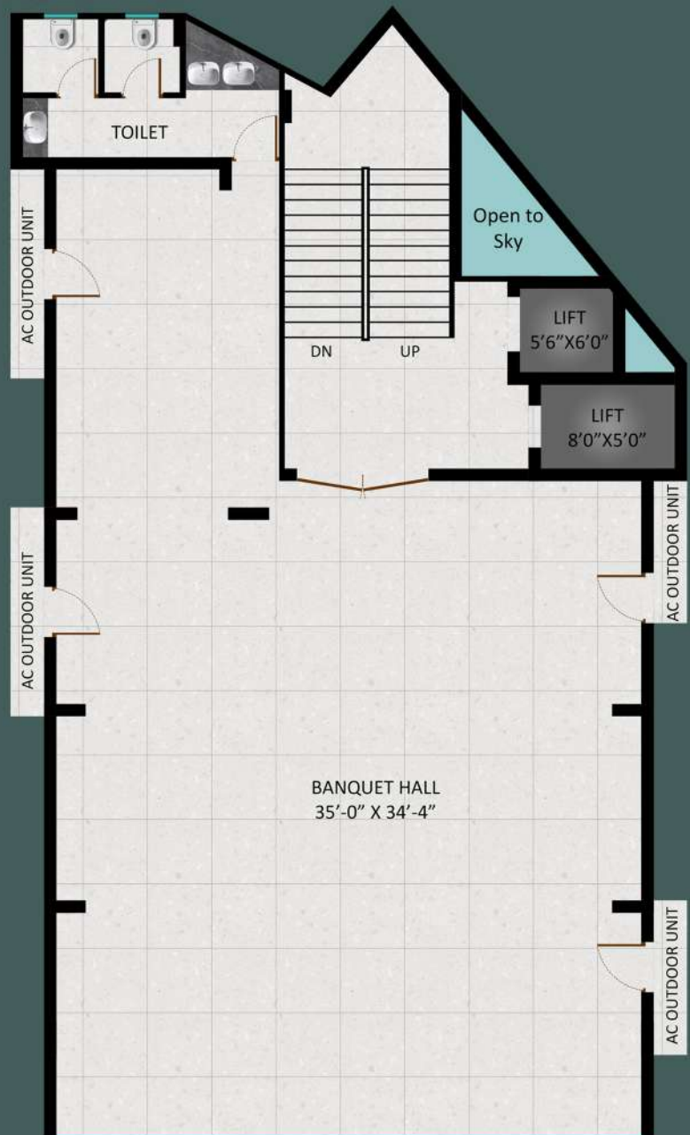
BANQUET FLOOR PLAN